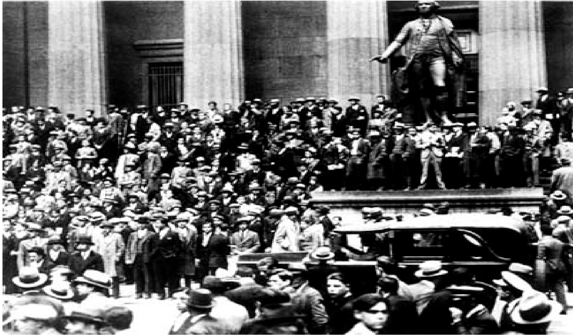
Una multitud aguarda para retirar sus depósitos