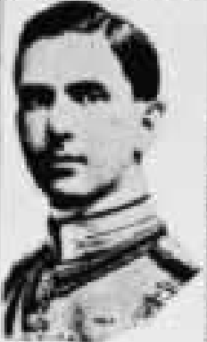
ITALY'S CROWN PRINCE