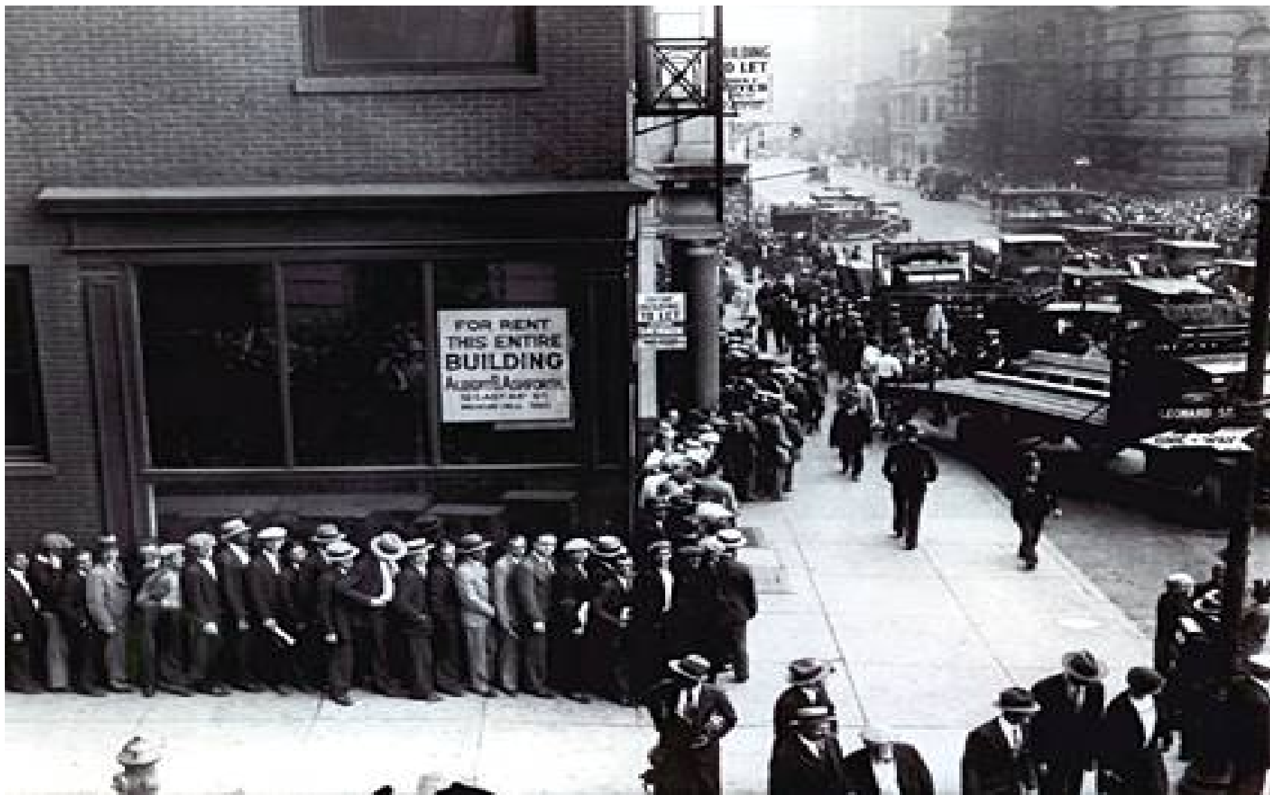
DESEMPLEO DURANTE LA GRAN DEPRESIÓN