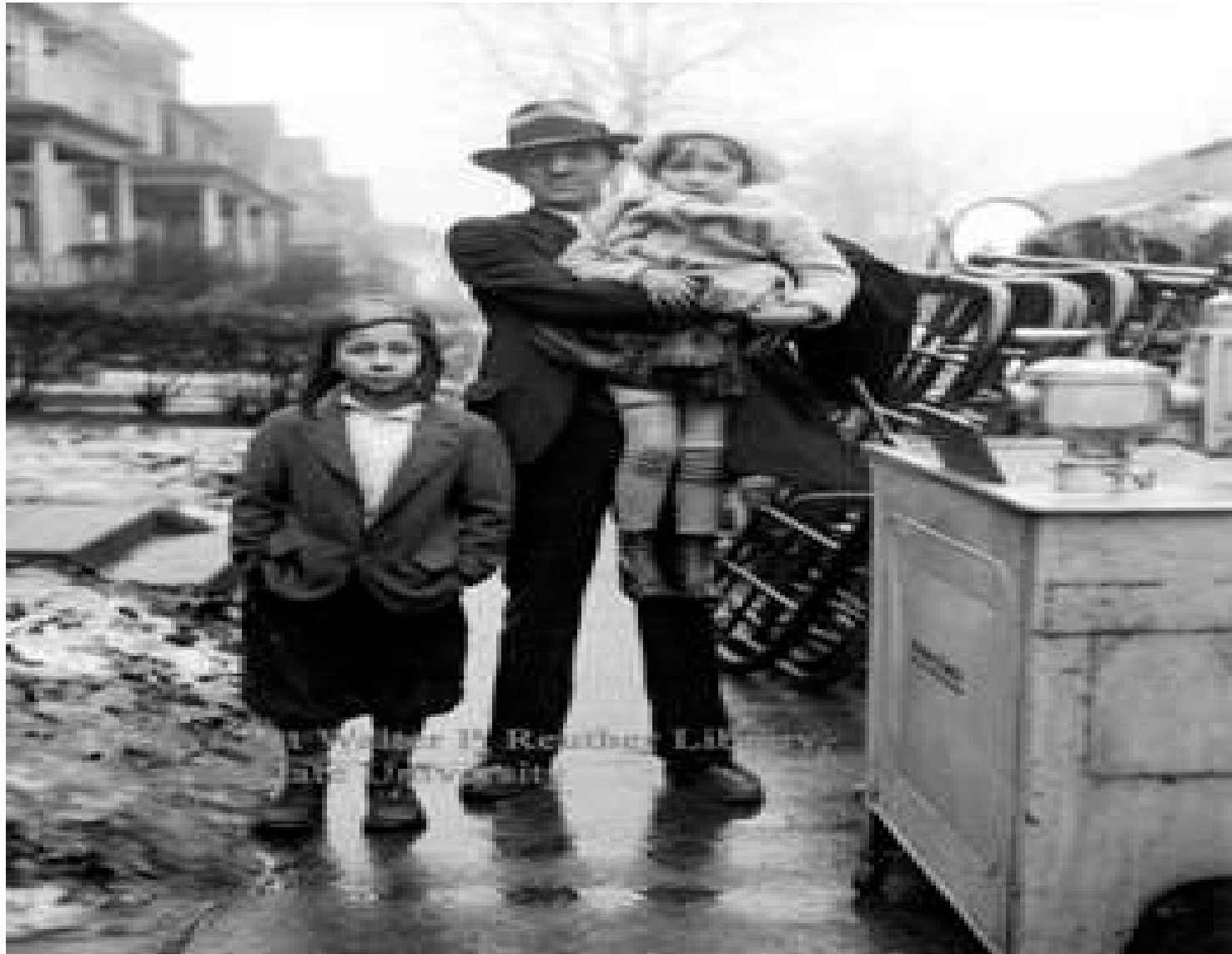
DESEMPLEO DURANTE LA GRAN DEPRESIÓN